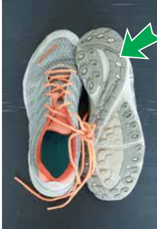
•Clean, good condition