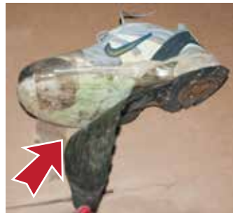
• Sole is falling off. Not in wearable condition.