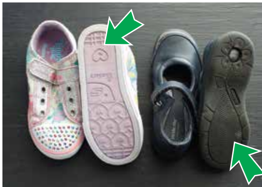
•Still wearable, clean, good condition