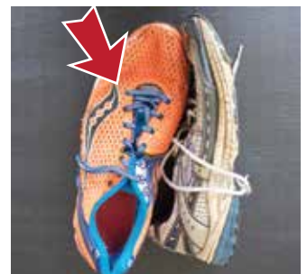
• Mismatched pair. Not bound together.