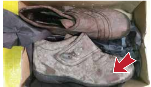
• Wet, moldy