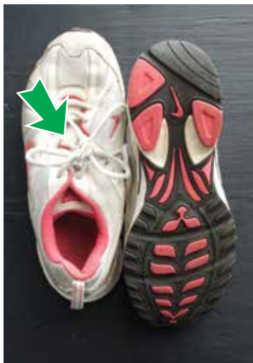
• Laces intact, lots of life left